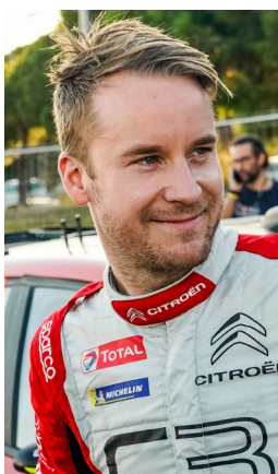
Mads Ostberg WRC-2 PRO

All year long, through the rocky gravel roads of South America, the thrilling high-speed stages of scandinavian countries, to the narrow and technical tarmac stages of France, Citroën C3 R5 drivers write down the history of rally, creating lifelong memories for themselves and the fans. From WRC to regional events, drivers - pros and amateurs alike - rely on Citroën C3 R5 core qualities : performance, reliability and accessibility.